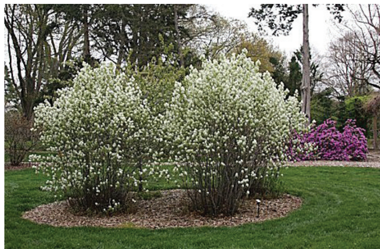
Figure 1. When possible, include plants in mulched beds rather than creating many individual mulched rings close together.