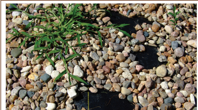
Figure 11. Perennial weeds can grow through landscape fabric and seeds of annual weeds that blow into a landscape can easily germinate in mulch placed above landscape fabric.