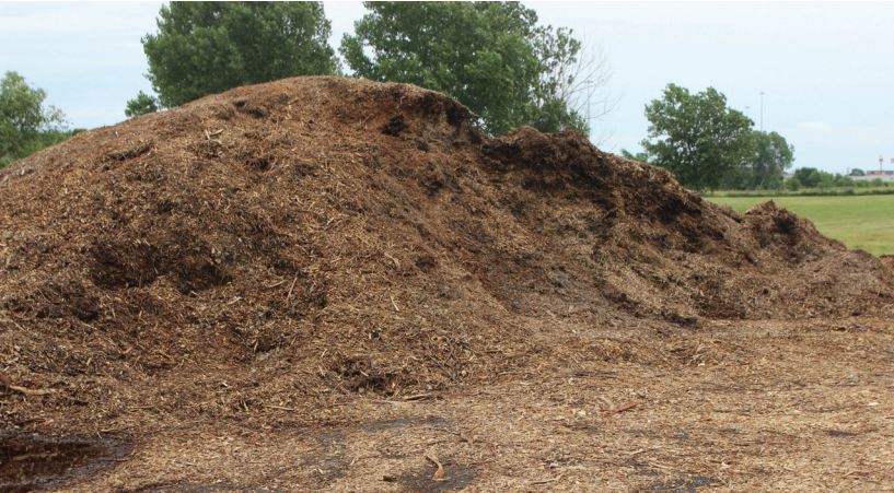
Figure 5. Bulk mulch is typically of mixed species, and may include trees removed due to storm damage or recycled Christmas trees. Bulk mulch may be free in many cities or as a service of power companies and parks departments.