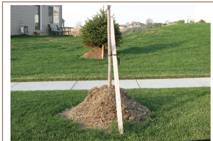
Figure 2. Mistakenly creating a “volcano” by placing mulch in a cone around the tree trunk may encourage insect and disease problems on thin-barked trees such as maples. It also may provide protected access for small rodents and other animals, which can severely injure the bark and cambium.