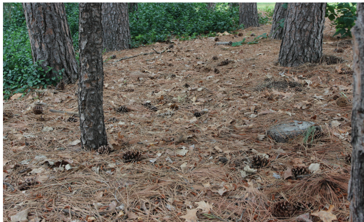
Figure 7. Let naturally occurring pine needle drop create a mulch or use bailed pine needle mulch to get a similar look.