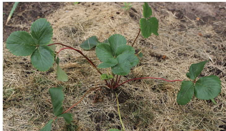
Figure 8. Grass clippings should be applied in layers no thicker than one inch and should be periodically raked throughout the growing season to reduce matting. Thicker layers will impede water and air movement in and out of the soil.