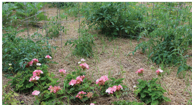
Figure 9. Straw will decompose quickly; however, some straw mulch contains high levels of weed seed that may germinate and compete with the desired plants.