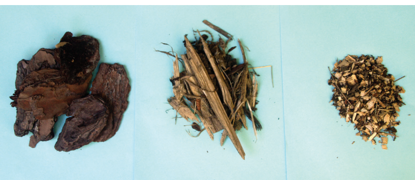
Figure 6. Coarse bark wood chips, bulk hardwood mulch, and finely chipped hardwood mulch offer homeowners different options for appearance in the landscape.

hardwood can be produced from the bark and branches of almost any type of tree or recycled wood pallets (Figures 4-6). Wood chips are typically flattened and slightly rounded, and range in size from 1 inch to 4 inches. Shredded hardwood mulch may be almost stringy in appearance. Depending on the process used, the texture of shredded hardwood mulch can be very fine to coarse, with individual pieces 6 inches or more in length. High quality wood mulch may need only a light topdressing each year, with full replacement being necessary after two to four years depending on the use of the area.