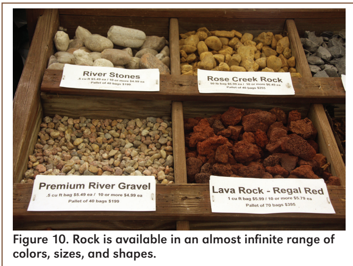
Figure 10. Rock is available in an almost infinite range of colors, sizes, and shapes.

to cake together, causing water to shed rather than soak into the soil. Additionally, sawdust mulch can cause nitrogen deficiency in desired plants since it's high carbon:nitrogen ratio ties up soil nitrogen during the degradation process. If used, sawdust should be aged one year and applied in a layer no more than 1 inch thick.