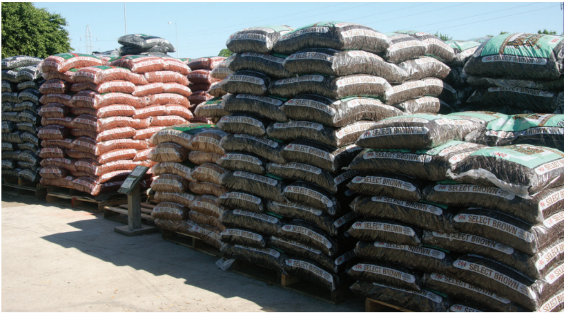
Figure 4. Mulch of a single type of wood, such as pine, cedar, or cypress, is most often available bagged. Bags are easy to handle, and the mulch may be free of weeds due to high temperatures in the bags during shipping. Bagged mulch is often more expensive than bulk mulch.