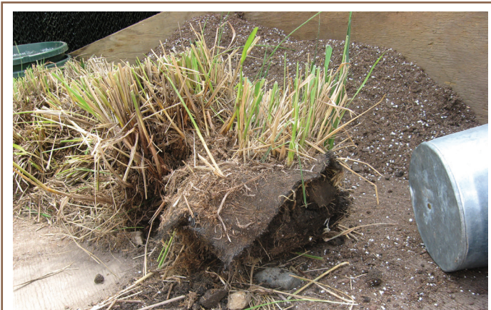
Figure 12. Landscape fabric is a management challenge when beds contain spreading herbaceous plants. Their root systems will become intertwined with the fabric making it difficult to lift and divide them.

the fabric (Figure 11). Roots often become intertwined with the fabric, causing difficulties when transplanting (Figure 12). Landscape fabrics are not recommended for most settings, although they do prevent rock mulches from working their way into the soil.