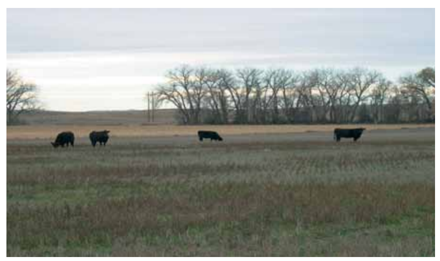
Figure 1. Cows graze winter wheat stubble near Bridgeport.

Grazing cattle on winter wheat, often prior to grain harvest, is common throughout the southern Great Plains. Relatively high and volatile wheat prices have increased the need for management to analyze grain production and wheat grazing decisions. Benefits can be realized by grazing prior to the primary environmental risk period for drought, heat stress, and hail, all of which frequently reduce grain yield while having limited impact on forage production. Cattle also are grazed on winter wheat fields in western Nebraska and the surrounding region. Typically in Nebraska, fall forage would be used to graze cows and reduce winter supplement costs and to lower stocker operation feed costs in the spring. In many cases, wheat is grazed as a forage and also harvested at maturity for grain.