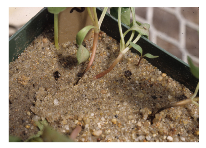
Figure 1. Black, thin stems and lack of cotyledon wilting, characteristic of acute seedling phase of the disease caused by A. cochlioides . Note the pink-colored stem of healthy plant.

One of the most important root diseases in sugarbeet production is Aphanomyces root rot, caused by the soilborne oomycete Aphanomyces cochlioides. Today A. cochlioides is well recognized as a pathogen wherever sugarbeet is grown worldwide. In the United States, the pathogen occurs infrequently in the far west states but is a growing problem in other regions, particularly southern Minnesota and the Red River Valley of North Dakota and Minnesota. Over the last decade, the incidence of this pathogen has decreased as a result of the extended drought. However, after extensive soil testing, the pathogen has been demonstrated to be widely