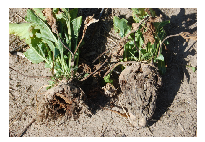
Figure 9. Severe distortion of sugarbeets due to previous A.\ cochlioides infection.