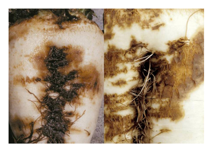
Figure 5. Root lesions of Aphanomyces root rot of sugarbeet — initial water-soaked lesions ( left ) and scabby lesions after drying ( right ).

The chronic root rot phase occurs on plants infected earlier in the season or from new infections on older plants, and is more common than the acute phase in many production areas. Foliar symptoms consist of stunted, yellowed leaves with non-vigorous growth (Figure 3). Wilting also may occur during the day, but plants often recover at night (Figure 4). Permanent wilting is not common, in contrast with Rhizoctonia root rot. Leaves also may take on a scorched appearance and become brittle. Root symptoms begin as yellowish-brown, water-soaked lesions on taproots, (Figure 5, left) that later become dry and necrotic (scarring) if infection ceases (Figure 5, right). These lesions can occur anywhere on the taproot, but often occur toward the distal end as a tip rot (Figure 6). If disease continues to progress, the lesions penetrate into the root interior, causing a yellowish-brown discoloration of infected tissues (Figure 7). Similar to the acute phase, if environmental conditions become more favorable for plant growth, plants may recover to produce a relatively healthy crop; however, many roots may still exhibit varying degrees of root distortion and/or scarring (Figures 8 and 9), which are indicative of previous A. cochlioides infections. In severe cases, the extent of the disease can completely destroy taproots, leaving