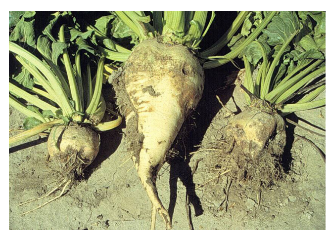
Figure 10. Severe rotting symptoms of Aphanomyces root rot of sugarbeet.