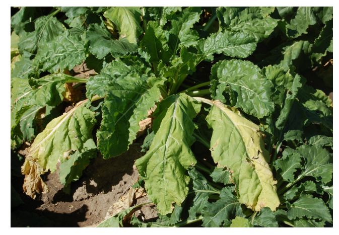
Figure 4. Foliar symptoms (yellowing and wilting) characteristic of Aphanomyces root rot.

The chronic root rot phase occurs on plants infected earlier in the season or from new infections on older plants, and is more common than the acute phase in many production areas. Foliar symptoms consist of stunted, yellowed leaves with non-vigorous growth (Figure 3). Wilting also may occur during the day, but plants often recover at night (Figure 4). Permanent wilting is not common, in contrast with Rhizoctonia root rot. Leaves also may take on a scorched appearance and become brittle. Root symptoms begin as yellowish-brown, water-soaked lesions on taproots, (Figure 5, left) that later become dry and necrotic (scarring) if infection ceases (Figure 5, right). These lesions can occur anywhere on the taproot, but often occur toward the distal end as a tip rot (Figure 6). If disease continues to progress, the lesions penetrate into the root interior, causing a yellowish-brown discoloration of infected tissues (Figure 7). Similar to the acute phase, if environmental conditions become more favorable for plant growth, plants may recover to produce a relatively healthy crop; however, many roots may still exhibit varying degrees of root distortion and/or scarring (Figures 8 and 9), which are indicative of previous A. cochlioides infections. In severe cases, the extent of the disease can completely destroy taproots, leaving