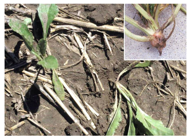
Figure 2. Young sugarbeet plant infected by A. cochlioides. Thin, delicate stems are more susceptible to breakage and stand loss from high winds (inset).

If conditions become unfavorable for further disease development, plants may recover and still produce a relatively normal crop. Severely affected plants from black root have very delicate, thin stems, and are often more susceptible to breakage from high winds in the spring ( Figure 2 ).