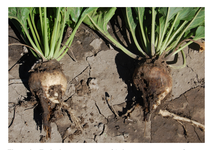
Figure 6. Early tip rot symptoms of Aphanomyces root rot of sugarbeet.

little except the crowns (Figure 10), yet often still may maintain deceptively healthy looking tops. Economic loss also may occur at harvest due to this disease because beets affected to this degree are easily dislodged from soil, and roots knocked into furrows during the defoliation process are not subsequently retrieved by the harvester (Figure 11).