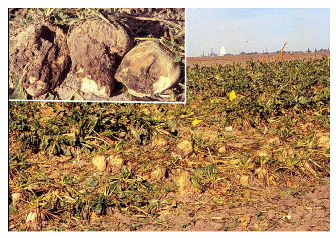
Figure 11. Aphanomyces-infested field at harvest and severely scarred and distorted roots broken off at ground level after defoliation (inset).