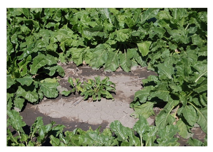
Figure 3. Foliar symptoms (yellowing and stunting) characteristic of Aphanomyces root rot.