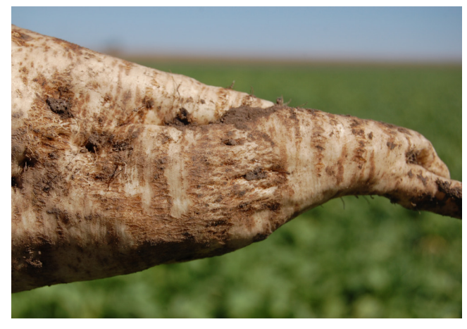
Figure 8. Mild scarring of sugarbeet due to previous A.\ cochlioides infection.