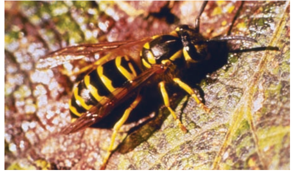
Figure 1. Yellowjacket.

spiders upon which they prey. These insects are normally quite docile and rarely attack people. Social bees and wasps such as yellowjackets, paper wasps, and honey bees use their stingers and venom as defensive weapons. When forced to defend themselves or their nests, they often will attack the intruder in large numbers.