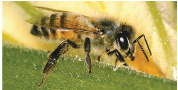
Figure 4. Honey bee.

dark. Knocking down a nest without an insecticide treatment is usually ineffective since these wasps will rebuild the nest in a short time.