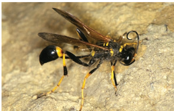
Figure 7. Mud dauber.

This is the largest wasp species in Nebraska. They are up to 2 inches long and are boldly marked with yellow stripes on a black body. Cicada killers are most abundant during mid-summer when their prey, cicadas, are active. Cicada killers attack, sting, and carry paralyzed cicadas back to underground burrows. These burrows can be found near walks, driveways, and retaining walls and can usually be identified by the presence of fresh soil around the 1/2-inch entrance hole. Once the paralyzed cicada has been dragged underground, the wasp deposits an egg on it. Upon hatching, the wasp larva uses the cicada as a source of food. These wasps are normally very docile and are unlikely to sting unless provoked. If nesting activities become a problem, infested areas can be treated with an insecticide ( Table 1 ).