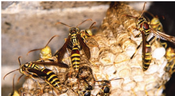
Figure 3. Paper wasps.

c) Nests within cavities : Yellowjackets occasionally build their nests in wall voids, cracks in stone walls, or other cavities associated with buildings. In such cases, do not seal the entrance hole following the insecticide treatment because yellowjackets attempting to leave the nest may enter the building through inside openings. Insecticide dust formulations (Table I) are preferred since the workers entering or leaving the nest will tend to be contaminated.