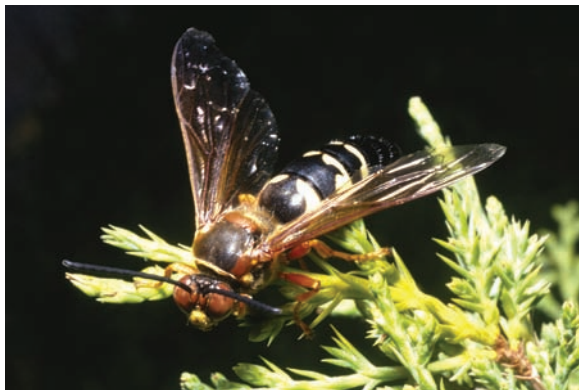
Figure 6. Cicada killer.

foundation. Bumble bees are large, robust bees covered with dense black and yellow hairs. They commonly reach 1 inch in length. Bumble bees usually are not overly aggressive, but they will sting if molested. Avoid flower patches where adult bumble bees are likely to be visiting. These bees can be controlled by spraying or dusting insecticides into their nests. Retreatment may be necessary.