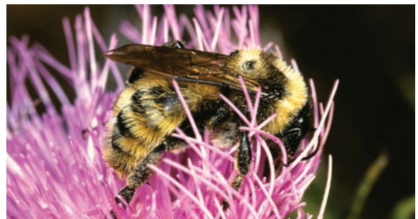
Figure 5. Bumble bee.

CAUTION: You should never use honey or wax from honey bee colonies that have been treated with an insecticide. Also, never attempt to kill bees in buildings with liquid petroleum, gasoline, or any other flammable material. The entire structure may be destroyed along with the bees.