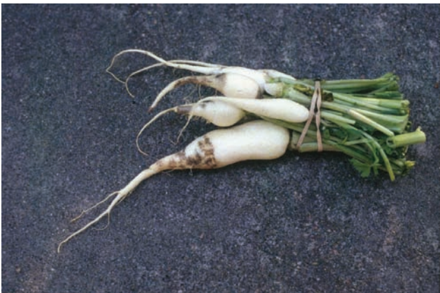
Figure 2. Rhizoctonia on radish roots.

• Do not apply excessive amounts of nitrogen early in the season, especially forms of ammonium such as urea or ammonium nitrate. High nitrogen, either in the soil or in the crop, increases the pathogenicity of Rhizoctonia . The level and form of fertilization you choose for your crop