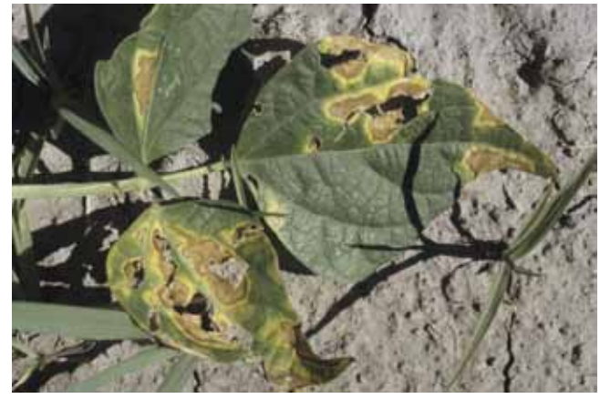
Figure 12. Dry bean leaves damaged by hail. Note symptoms of wilt infection associated with the tattered leaves.