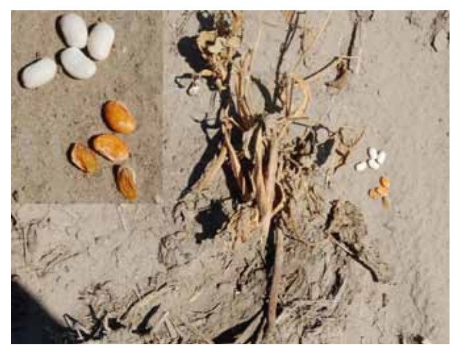
Figure 7. Dry bean plant surviving to harvest but producing discolored seeds as a result of wilt infection.