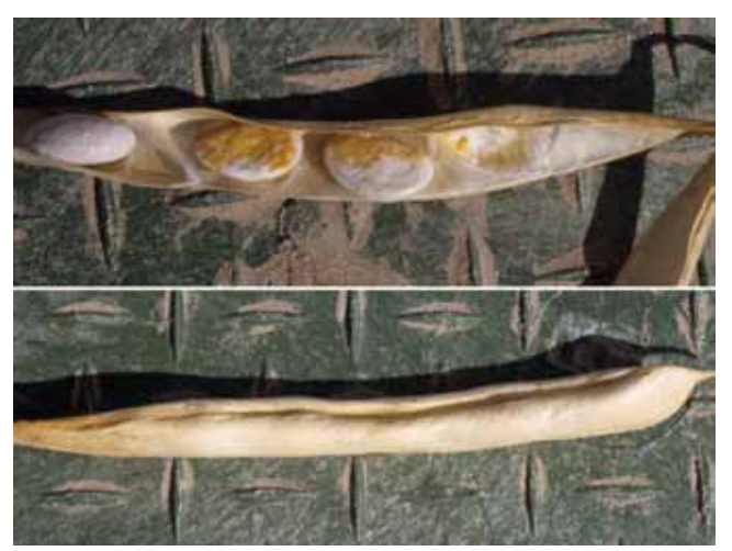
Figure 8. One pod of wilt-infected dry bean plant showing discolored seeds (top) inside a pod with no external symptoms (bottom). Note that not all seeds are infected or discolored.

Bacterial diseases of dry beans are very difficult to manage due to the lack of information on the effectiveness of