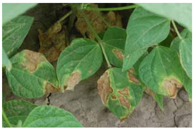
Figure 4. Marginal necrosis and yellowing symptoms associated with common bacterial blight.

Colony growth and staining of seeds reported for original isolates of Cff were always yellow until orange- and purplecolored variants were found in western Nebraska. The purple variant maintains a yellow-colored colony in culture, but produces an extracellular, water-soluble bright purple pigment that diffuses into growth medium within two to three days ( Figure 9 ) and also discolors seed. The purple variant, which is very rare, has only been reported once outside of the western Nebraska Panhandle — from cull bean seeds in Alberta, Canada, in 2006. The pigment produced by the purple variant is often unstable and inconsistently expressed, which may explain this variant's lower reported incidence in nature.