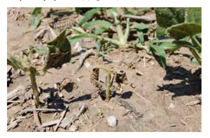
Figure 2. Death of a dry bean seedling due to bacterial wilt.

Infected plants in Nebraska have additionally exhibited symptoms consisting of interveinal, necrotic lesions surrounded by bright yellow borders ( Figure 3 ). These symptoms may be confused with those caused by common bacterial blight, Xanthomonas axonopodis pv. phaseoli , (synonym X. campestris pv. phaseoli ) ( Figure 4 ), but bacterial wilt lesions