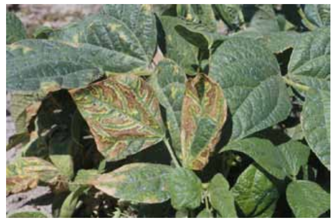
Figure 3. Interveinal necrotic symptoms with irregular yellow halo, characteristic of wilt.