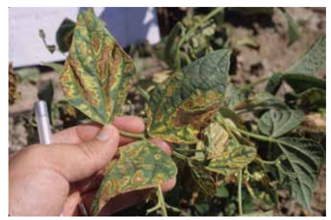
Figure 5. Necrotic and wavy yellow border symptoms associated with wilt. Note systemic and irregular nature to necrosis contrasted with common blight symptoms in Figure 4 .

tend to be more wavy or irregular ( Figure 5 ). Additionally, water soaking of leaves is not usually observed with wilt, as it is with common bacterial blight and halo blight ( Pseudomonas syringae pv. phaseoli ) infections. However, water soaking has commonly been observed on bacterial wilt infected yellow bean leaves in Colorado ( Figure 6 ).