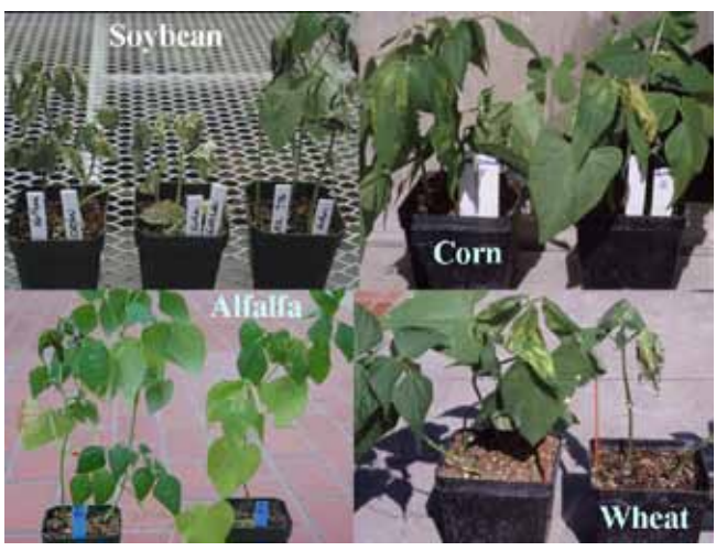
Figure 13. Wilt symptoms on dry bean plants inoculated by bacterial isolates collected from bacterial-infected crops grown in rotation with dry beans. Clockwise from upper left: isolates associated with soybean, corn, wheat, and alfalfa.