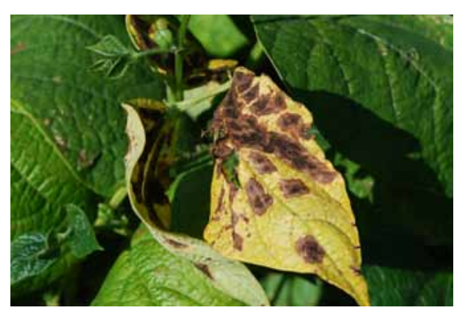
Figure 6. Water-soaking symptoms on yellow beans due to wilt.

Since 2005, all three pathogen color variants have been isolated from infected dry bean seeds ( Figure 10 ) and plants in western Nebraska fields during the season, with more than 90 percent of collected isolates during this time consisting of the yellow and orange variants ( Figure 11). Following the 2007 growing season, a pink bacterial isolate ( Figure 11 ) closely resembling the wilt pathogen was recovered on isolation media from orange-stained seeds (market class great northern) that originated from research plots affiliated with the University of Nebraska–Lincoln Panhandle Research and Extension Center (ScottsbluffAg Lab) near Mitchell, Neb.