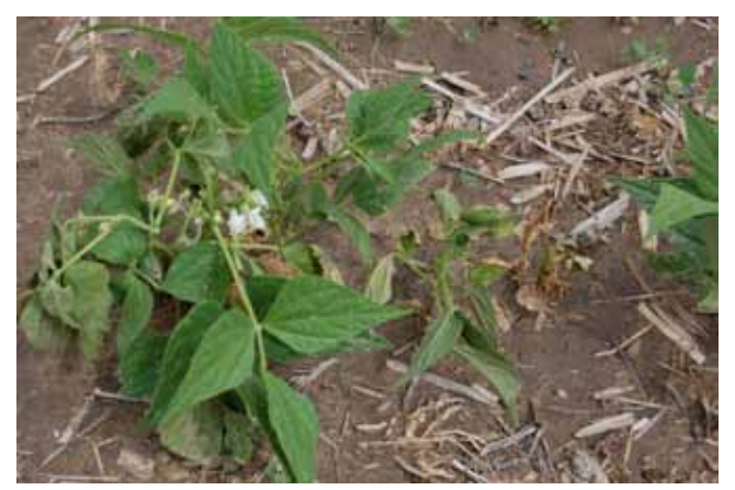
Figure 1. Leaf wilting symptoms on dry beans due to bacterial wilt.

The pathogen was again identified in 2003 for the first time in this area in almost 25 years. Over the last seven to eight years, it has fully re-emerged in the Central High Plains (Nebraska, Colorado, and Wyoming) and has now been identified from more than 400 fields. Affected fields were planted with dry beans from multiple market classes