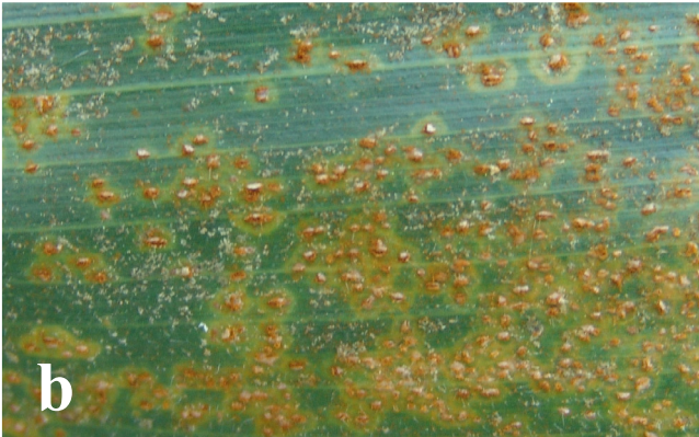
Figure 1. Magnified pustules of the common rust fungus, Puccinia sorghi (a) and southern rust fungus, Puccinia polysora (b).

Timing of disease development and its severity determine the extent of yield loss. Yield loss estimates of up to 45 percent have been reported in Florida, due to severe southern rust. For each 10 percent leaf area infected by common rust, approximately 6 percent of yield loss was reported in Illinois sweet corn.