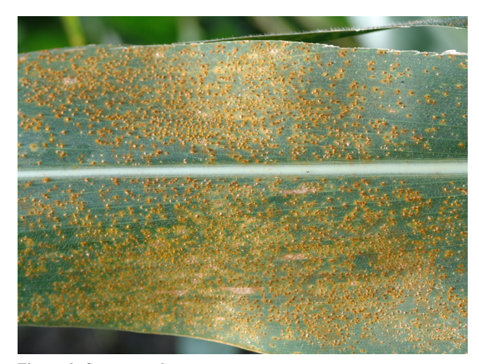
Figure 6. Severe southern rust.

Urediniospores serve as both primary and secondary inoculum for initial and repeated infections, respectively, for the southern rust fungus. Although, in Nebraska, the fungus produces dark teliospores later in the season ( Figure 2 ), they do not germinate and are considered unimportant in the disease cycle. No alternate hosts have been identified for this fungus and urediniospores and teliospores are