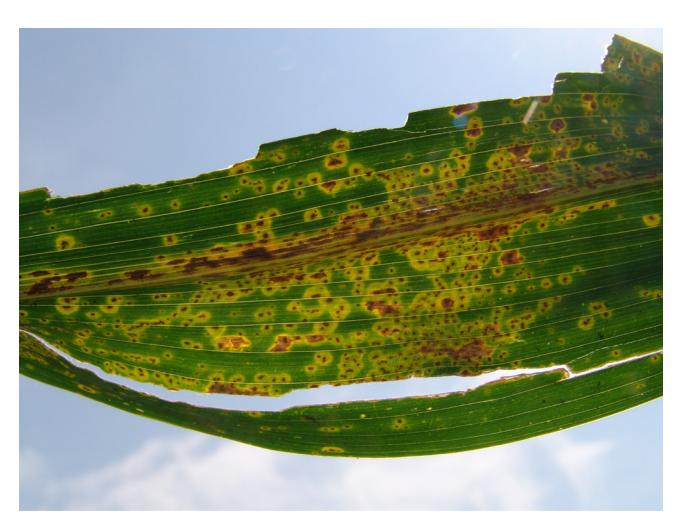
Figure 3. Haloes surrounding southern rust pustules can be observed in some hybrids.

to orange in color and predominantly on the upper-leaf surface ( Figure 1b ). Pustules tend to occur only sparsely on the leaf underside, but may occur abundantly on the leaf sheath ( Figure 2a ). Haloes can be observed in some hybrids around pustules when leaves are backlit ( Figure 3 ). The pustules are usually more densely clustered than those of common rust. And, like common rust, the pustules can darken in color later in the season as the spore type changes ( Figure 2b ).