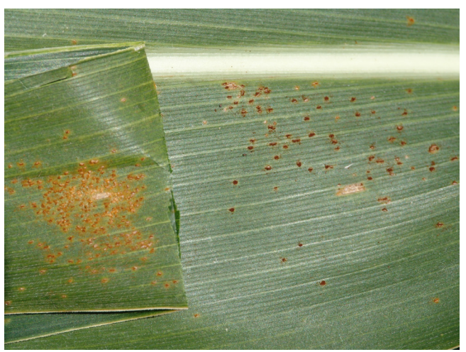
Figure 5. Dense clustering of orange, southern rust pustules (left) compared to the sparsely scattered, reddish-brown pustules of common rust (right).

Urediniospores, formed in the pustules, cause repeated secondary infections and may be produced abundantly. In fact, up to 5,000 spores have been reportedly produced per common rust pustule, indicating the tremendous reproductive capacity of rust fungi.