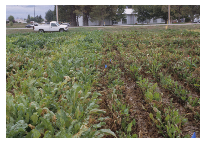
Figure 9. Benefits of genetic resistance to the pathogen after a severe CLS epidemic. Plants at right are susceptible and those on the left are tolerant.