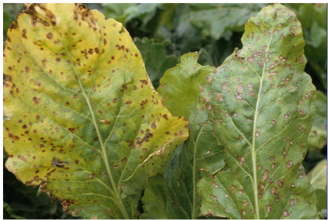
Figure 6. Cercospora-infected leaves. Leaf at left is beginning to yellow and die