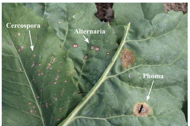
Figure 2. Comparison of symptoms among other common foliar diseases of sugar beets. Reading from left to right: Cercospora, Alternaria, Phoma leaf spots.