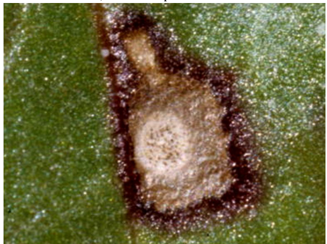
Figure 4. Macroscopic view of pseudostromata within lesion centers.

Generally, temperatures at night in western Nebraska are near the lower limits favoring disease development, but leaf wetness does occur (particularly with sprinkler irrigation). Very little infection will occur below 60°F or during periods of less than 11 hours of leaf wetness. Greater spore germination and leaf infection generally occurs when night temperatures exceed 60°F and day temperatures are between 80° and 90°F.