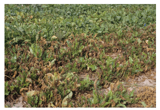
Figure 8. Severe infection from a distance, giving plants the appearance of being burned or scorched.

symptoms were present, then a fungicide application would be warranted. If on Day 3, there were 12 hours of leaf wetness and the temperature during this period was 62°F, then the DIV sum for Days and 2 and 3 is 4+0=4, and no action would be necessary.