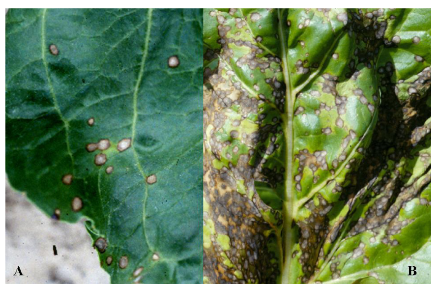
Figure 1A-B. Individual ash-colored circular lesions with dark brown borders (A). Advance infection with coalescing of individual lesions (B).

Losses due to this disease can approach 40 percent, and are represented by both root tonnage and sugar percentage in roots. Beets with low sugar levels do not store well, and losses in storage result from increased storage decay. Profitable yields are additionally reduced due to greater levels of impurities in roots and increased sugar loss to molasses during processing.