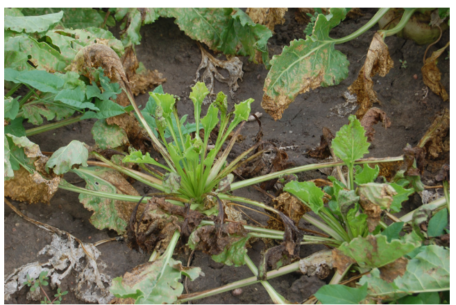
Figure 7. Severe infection with multiple leaves completely dried, dead and covered with masses of coalesced lesions. New growth emerging is unaffected.