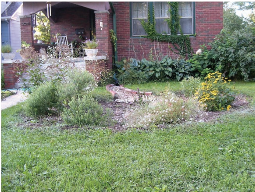
Figure 1. Residential rain garden

The type of soil is the key to an effective rain garden. The soil must allow rain to infiltrate fast enough when the rain garden is full so that it will drain in 24 to 48 hours. For the rain garden to work properly, the infiltration rate into the soil should be 0.25 inches per hour or greater. This is not a problem for soils containing large amounts of sand, but could be a problem for soil high in clay. If the soil does not meet this criterion, or cannot be amended to enhance infiltration, a rain garden may not be right for that site. How to determine