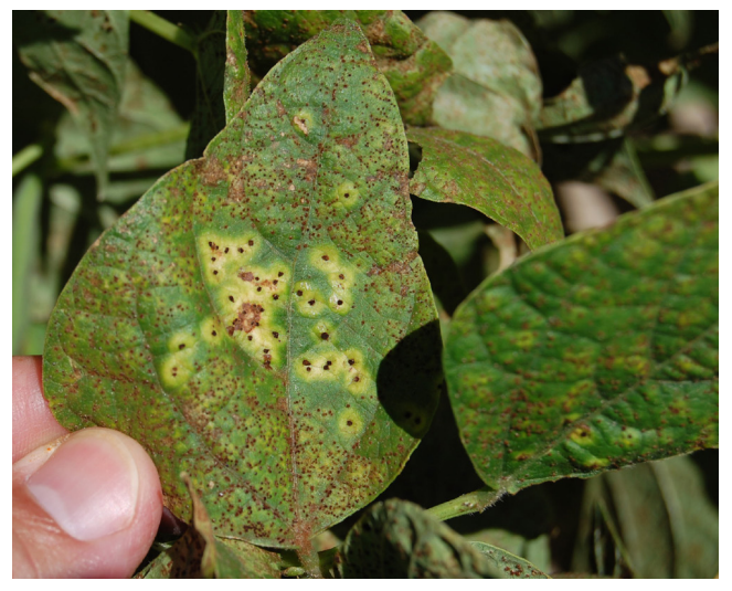
Figure 2. Advanced uredinial pustules surrounded with yellow borders containing reddish-brown repeating spores

Near the end of the season, pustules undergo a subtle change and form telia containing brownish-black winter spores (teliospores) ( Figure 6 ) signaling the end of the current infection cycle ( Figure 7 ).