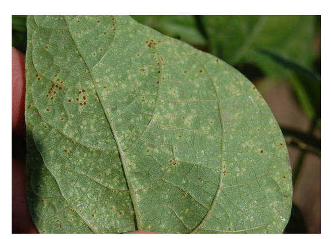
Figure 1. Early uredinial pustules consisting of small, raised white spots