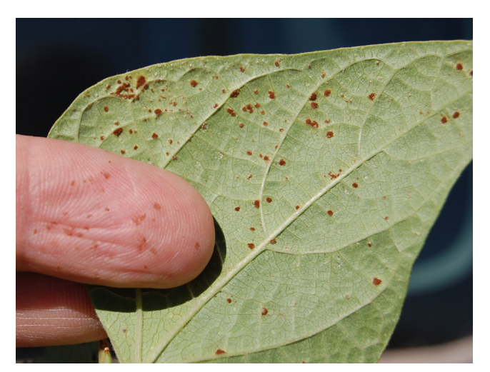
Figure 3. Urediniospores rub off on finger after making contact with pustules.