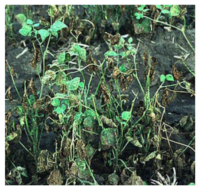
Figure 4. Severely infected bean plants