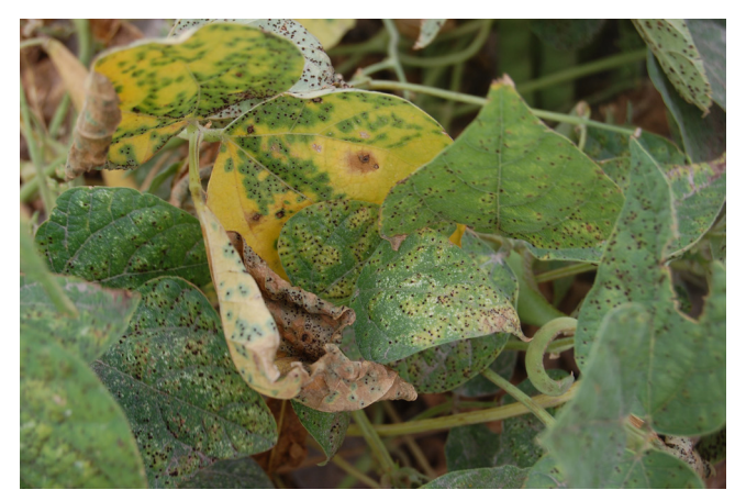
Figure 6. Pustules late in season containing dark, overwintering teliospores