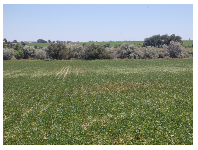
Figure 5. Severely infected bean plants shown from a distance (browning and necrotic patches)

Rust spores, particularly teliospores, overwinter in bean straw in some regions of the U.S., including the central High Plains. Teliospores germinate in the spring and produce basidiospores that are aerially dispersed onto volunteer or newly seeded bean plants in late May or early June. Volunteer plants in fields of irrigated corn and winter wheat often are unnoticed sources of inoculum. Bean plants become infected by basidiospores that initiate specialized types of white pustules called pycnia and aecia ( Figure 7 ). These pustules