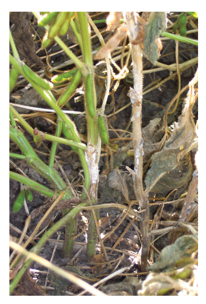
Figure 4. Sclerotinia stem rot (white mold) on soybeans.