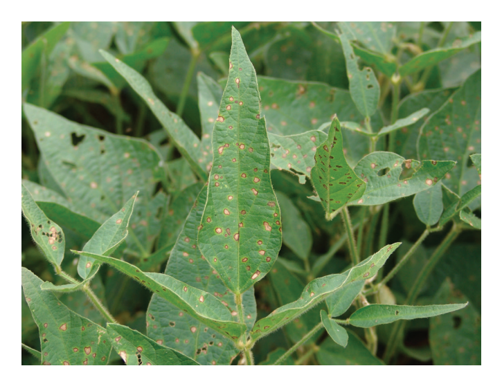
Figure 3. Frogeye leaf spot on soybeans.

Some foliar fungal diseases of soybean have similar life cycles, which means controlling one disease may help control other diseases. For example, the pathogens that cause brown spot, Cercospora leaf blight and frogeye leaf spot produce spores that overwinter in soybean residue. If crop rotation is used to manage frogeye leaf spot, incidence of brown spot will also be reduced the next time soybeans are grown in the field. Please refer to Table 1 for disease response to specific management practices.