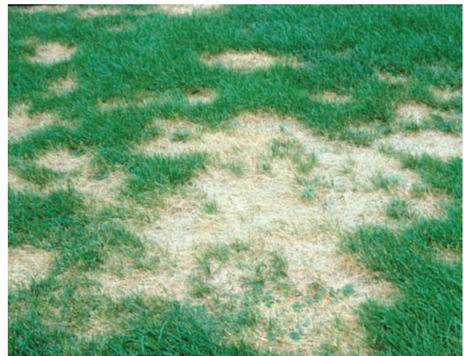
Figure 1. Symptoms of summer patch in Kentucky bluegrass. Note irregular areas of dead turf.