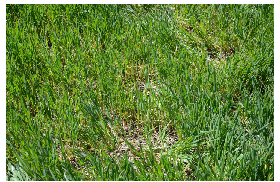
Figure 1. Wheat drilled into wheat residue on the soil surface. There is a high risk for the development of severe tan spot in this type of cropping system.

Tan spot, caused by the fungus Pyrenophora triticirepentis , is a major leaf spot disease of winter wheat in the Great Plains of North America. It is more severe in wheat cropping systems that maintain crop residue on the soil surface ( Figure 1 ). Although tan spot can be a serious threat by itself, it occurs more often as part of a leaf spot complex involving tan spot, Septoria leaf blotch, and spot blotch. In Nebraska, tan spot symptoms usually appear in April, but its effect on yield loss is greatest during grain fill when severe spotting reduces the photosynthetic area of the upper leaves ( Figure 2 ). The most severe damage occurs from the boot stage to the dough stage and is greatest on late tillers.