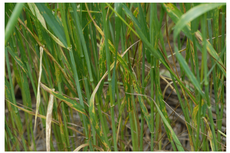
Figure 2. Severe spotting reduces photosynthetic area on the upper leaves.