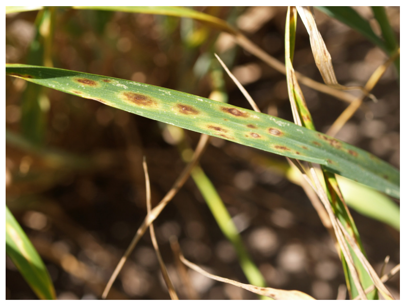
Figure 3. Characteristic symptoms of tan spot.