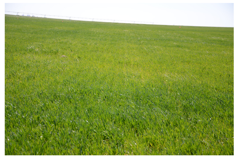
Figure 4. A wheat field with a yellow cast due to tan spot. The closeup picture in Figure 1 was taken in this field.

feel like coarse sandpaper to the touch. The occurrence of pseudothecia on wheat stubble will confirm that at least part of the leaf damage observed on the crop was due to tan spot, even if leaf symptoms were not readily recognized.