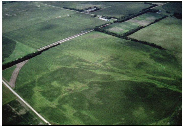
Figure 2. Iron chlorosis in soybean, western Nebraska.

gallons of water per acre and apply it directly with the seed, without adding any other fertilizer.