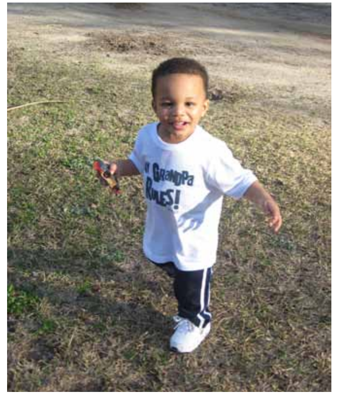
Figure 1. Play starts to become an important part of a toddler's life and can help them learn and develop motor skills.