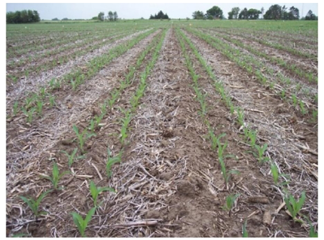
Figure 1. Twin-row planting of corn.

Selection of appropriate row spacing and seeding rate is influenced by the variable climatic conditions found in Nebraska. Mean annual precipitation ranges from 20 to 36 inches in the eastern two-thirds of the state and distribution varies seasonally. The length of the growing season as reflected by the number of growing degree days also differs across Nebraska. In general, the quantity of solar radiation from June through August is high.