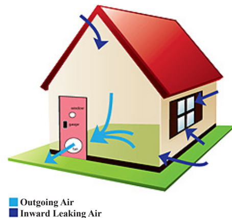
Figure 2. A blower door test measures air leakage and identifies where the home has leaks.

You can conduct your own air leak test on a windy day using your hand. Dampen your hand and hold it around closed windows, doors and other suspect places. A slight leak will make your hand feel very cool.