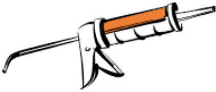
Figure 3. A caulking gun can be used to apply caulk.

Caulk is a semi-solid, toothpaste-like substance you apply into gaps no wider than 3/8 inch where different building materials meet, such as along a wall and the foundation. Hardware and building supply stores carry many varieties of caulk. Most often, caulking comes in tubes and is applied by using either a caulking gun ( Figure 3 ) or squeezing by hand.