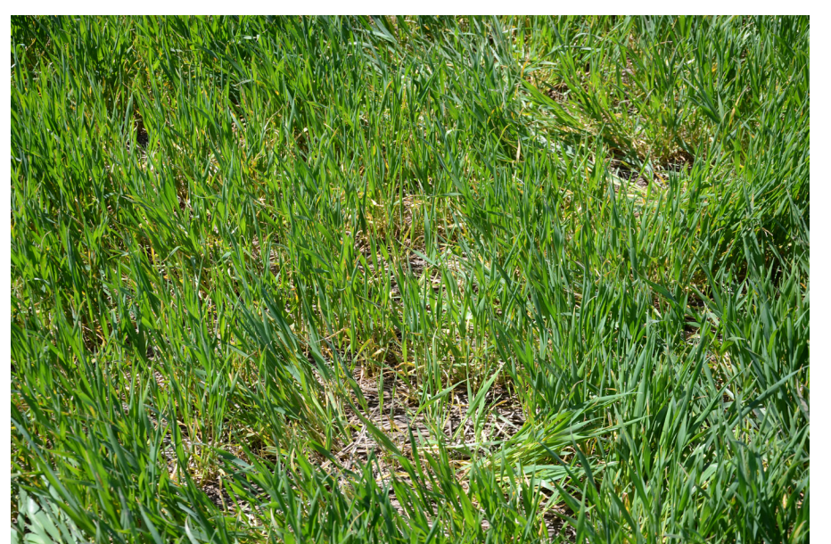
Figure 1. Wheat drilled into wheat residue on the soil surface. There is a high risk for the development of severe tan spot in this type of cropping system.

As plants mature, the fungus invades the straw, where it produces tiny, black, raised, fruiting structures called pseudothecia ( Figure 5 ). By mid-August, pseudothecia are visible on the stubble that remains after harvest and are diagnostic of tan spot. They