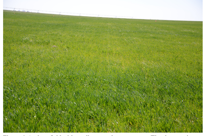
Figure 4. A wheat field with a yellow cast due to tan spot. The closeup picture in Figure 1 was taken in this field.

feel like coarse sandpaper to the touch. The occurrence of pseudothecia on wheat stubble will confirm that at least part of the leaf damage observed on the crop was due to tan spot, even if leaf symptoms were not readily recognized.