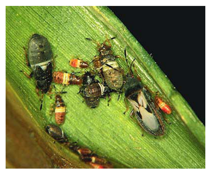
Figure 1. Chinch bug life stages.

The chinch bug is a native North American insect that can destroy cultivated grass crops, especially sorghum and corn, and occasionally small grains, such as wheat and barley. Broad-leaved plants are immune to feeding damage. Crop damage from this insect is most often found in southeast Nebraska and northeast Kansas and is associated with dry weather, especially in the spring and early summer months. Chinch bugs have few effective natural enemies. Ladybird beetles and other common insect predators found in Nebraska prefer to feed on other insects rather than on chinch bugs. Although chinch bugs can be difficult to control, many farmers have satisfactorily protected their crops with an integrated program of careful crop management and insecticide application.